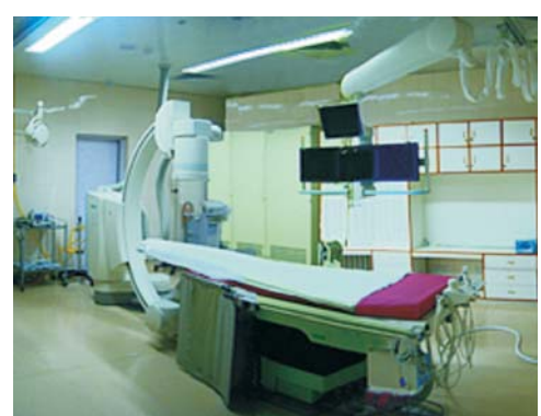
Himalayan Institute Hospital

Uttarkhand has adopted the essential drug list, which includes basic antipsychotropic medicine such as Chlorpromazine, Fluphenazine, Haloperidol (Antipsychotic), amitriptyline and clomipramine (antidepressants). However these drugs are not yet being procured by the government of Uttarkhand as there is no request made by the health facilities.<sup>25</sup>